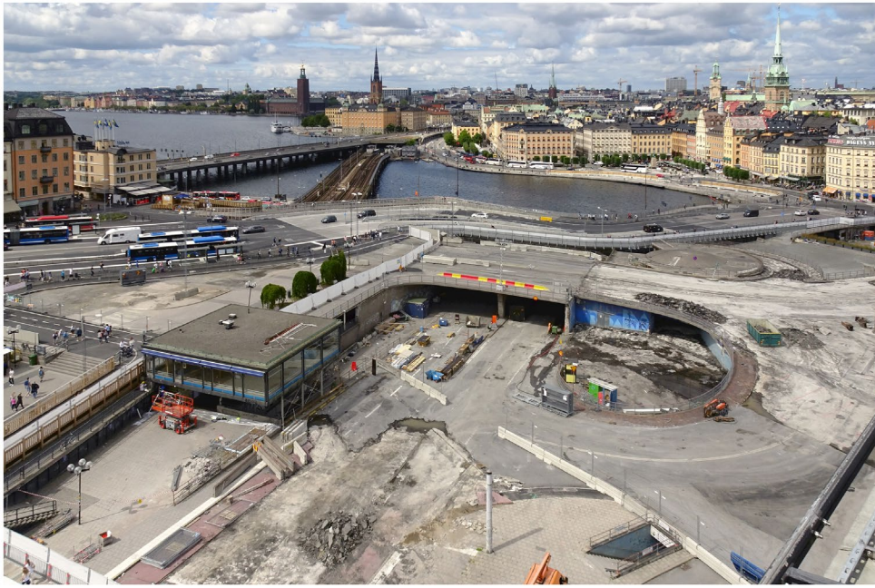
Figure 3 Demolition of the four-leaf clover proceeds in July 2016 (Credit: Holger Ellgaard/Creative Commons 4.0).

design and produce the scheme without drawings,” he said. “It would have been impossible to write a manual for hundreds of workers explaining how to simultaneously deliver standard drawings and high quality 3D models carrying data. With everyone working in just models and databases we could get everyone onboard much faster.”