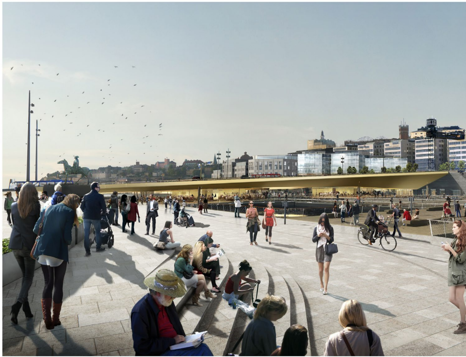
Figure 4 New Slussen aims to provide a “new civic quarter for all” that will knit the city back together again.

a team led by engineer WSP and principally involves the construction of a new bus terminal formed inside an excavation blasted out of the ground with dynamite.