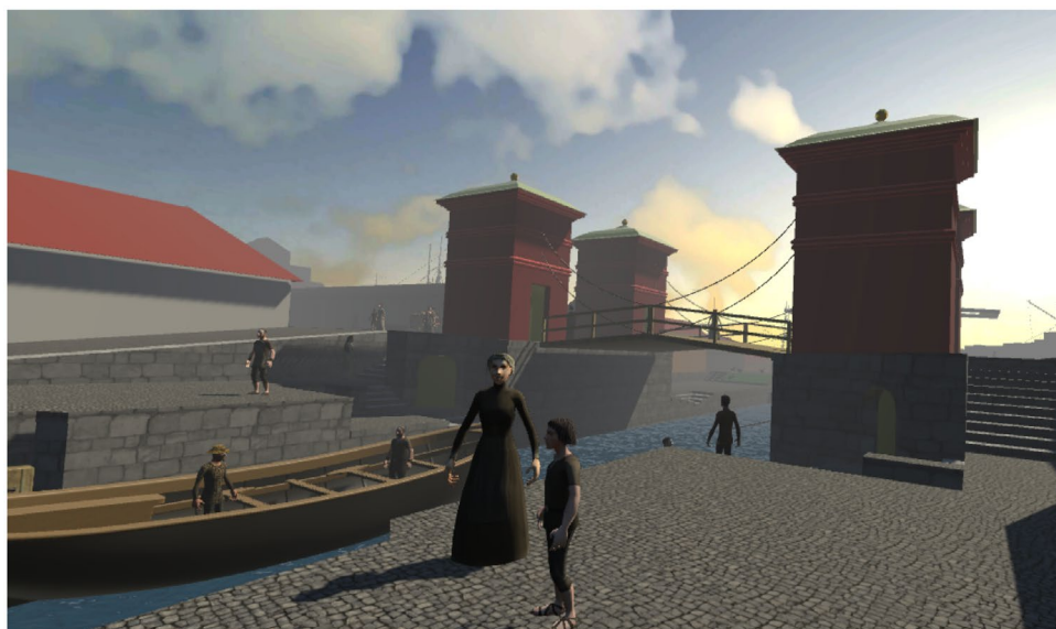
Figure 6 VR simulations showed how the Slussen looked in the 18th Century.

“What unites the area, throughout the ages, is its strategic location relative the capital, it is only a couple of hundred meters from the royal castle,” he says. “As it turned out, many of our assumptions and estimations are being confirmed during ongoing archaeological excavations in the area.”