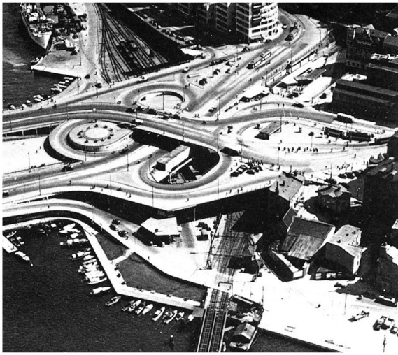
Figure 2 The Slussen cloverleaf in 1939.

Stockholm, one of the largest urban transformation projects in Europe, which has ambitions to become the first in the world to produce all its design information digitally, from early design through to handover, with no paper documentation at all. It is an ambitious goal, given the project's size and complexity. Covering 70,000 square metres, its aim is to create a new pedestrian-friendly urban quarter at the heart of the Stockholm archipelago, next to the navigation lock joining the Baltic Sea and the freshwater Lake Mälaren. The area's topography will undergo dramatic change, with the removal of a decrepit "four-leaf clover" road interchange built in the 1930s. Lasting until 2025, the project is split into more than a thousand discrete delivery packages, many of which are being designed in parallel with live construction work on site. At least 40 different contractors are involved.